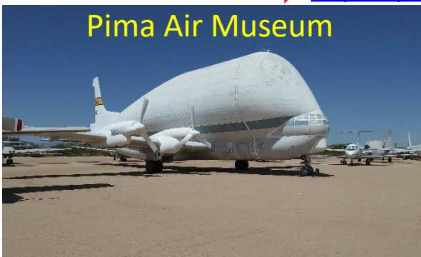
Pima Air Museum