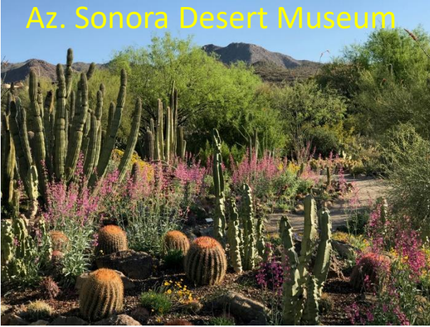
Az. Sonora Desert Museum