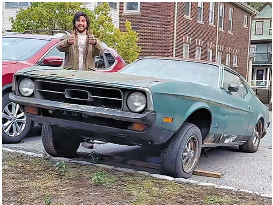
The 1972 Mustang is home!

Once I began the drive back to Boston, the feeling of looking at the Mustang in the rearview mirror was almost indescribable. In the span of two weeks, I had fully altered the course of my life and I had no clue.