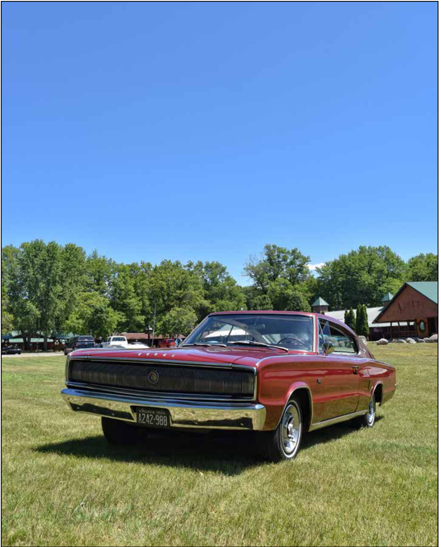
Quite an imposing grill!