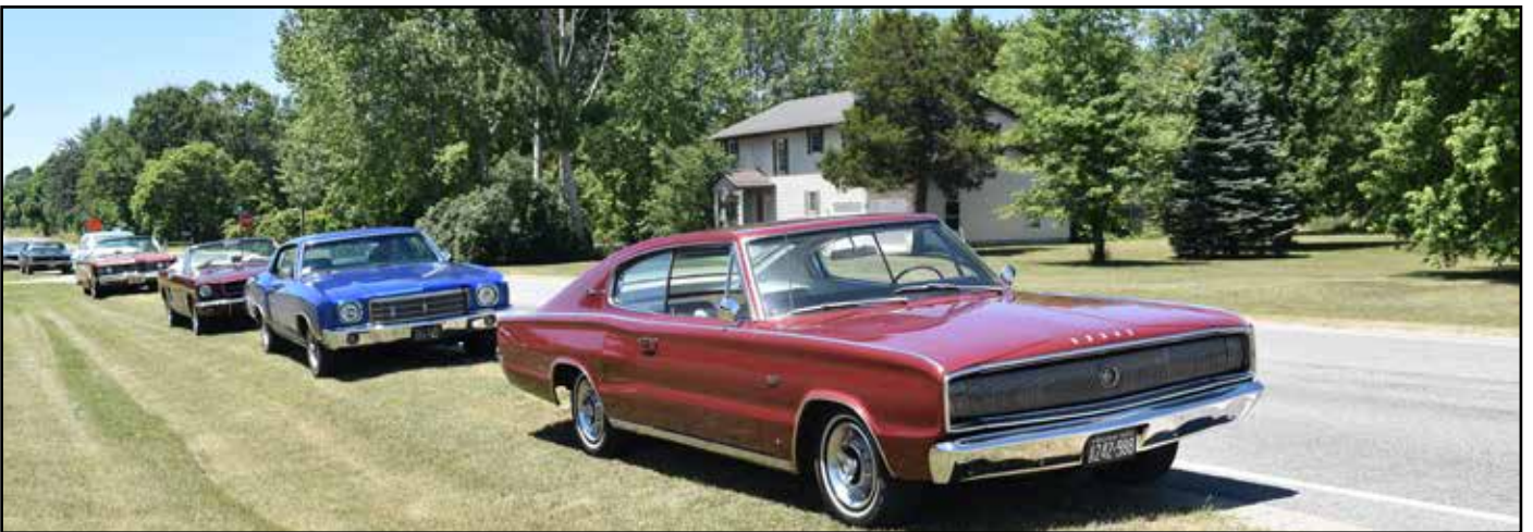
1966 Dodge Charger on recent Muscle Car Tour