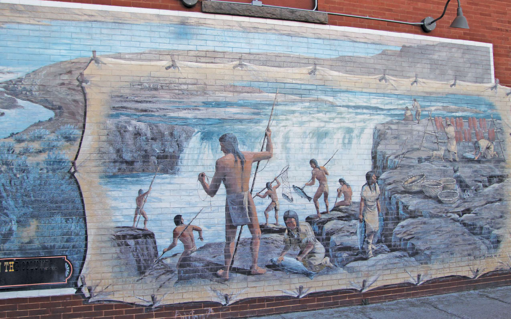
A mural in The Dalles, Oregon.

To cap off a busy day, we drove up a dizzying mile-long switch-back trail to Beacon Rock, which Clark wrote about in his journal on October 31, 1805. He called it "Beaten" Rock. From the top, you can see the gorge, carved by ice-age floods, which now divides Washington and Oregon.