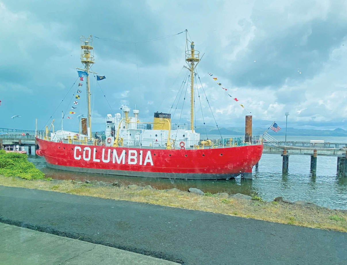
The Lightship Columbia exhibit at the Columbia Pacific Heritage Museum at Astoria, Oregon.

Our next stop was the Columbia Gorge Interpretive Center Museum. There, we saw the Lewis and Clark exhibit, Columbia River Indian artifacts, the world's largest Rosary collection, and a full-size replica of a fish wheel used by the canneries along the Columbia.