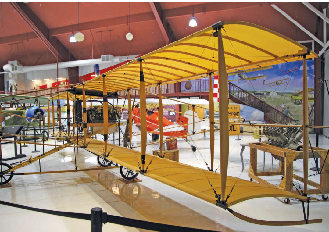
Below left to right: At the Pearson Air Museum at Fort Vancouver. The Columbia River cuts a winding path 1,243 miles long beginning in British Columbia and flowing to the Pacific.