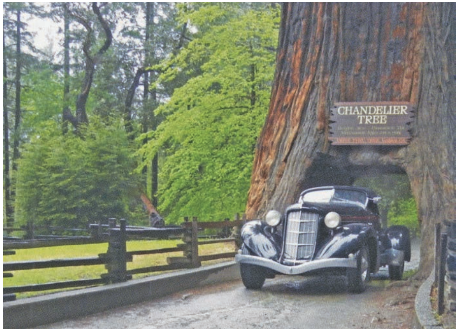
Above left to right: The Auburn plays in Yosemite snow! Driving through the Chandelier Tree in Leggett, California.