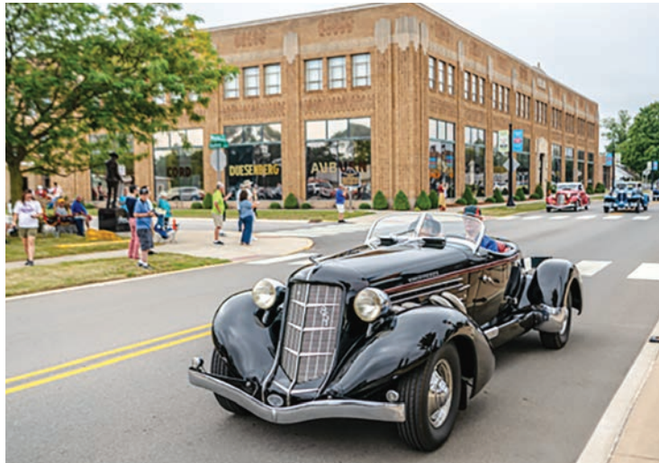
It's top down in Auburn, Indiana.

If you have ever seen the 1935 Auburn Speedster, you know there is no trunk. So, how do you pack for such a trip? There is a golf door and a small amount of space