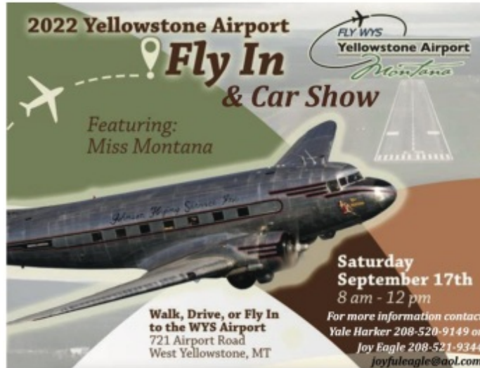
Yellowstone Fly-In – September 17 th