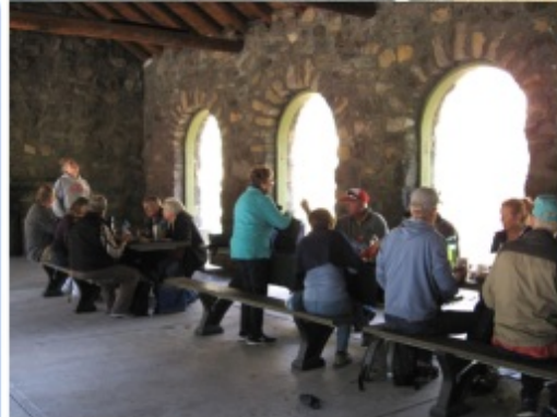
Members' Garage Tour — October 15th