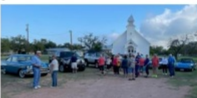
The Fredericksburg and Kerrville groups met in Harper before heading out to Paint Rock.