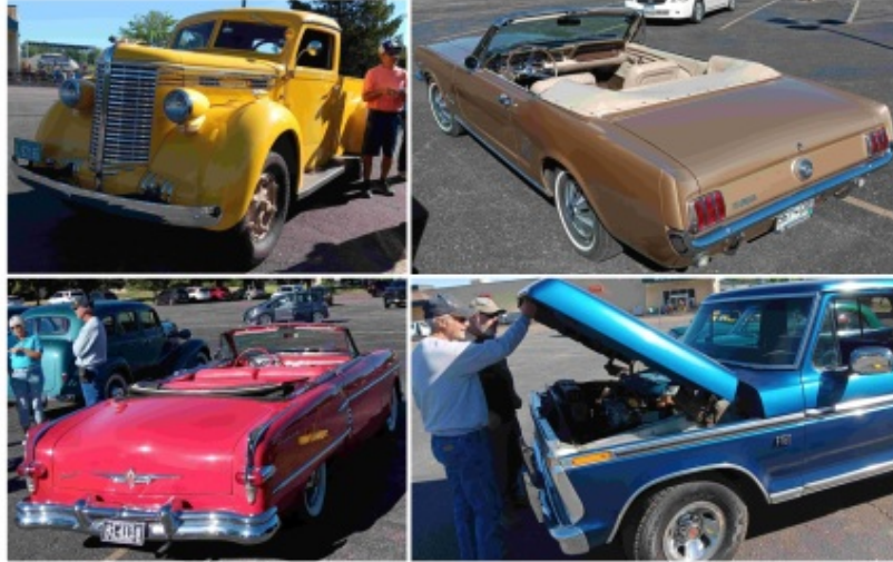
Tour Photos by Beth Kauffman