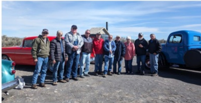
Market Lake Cleanup – Spring 2024