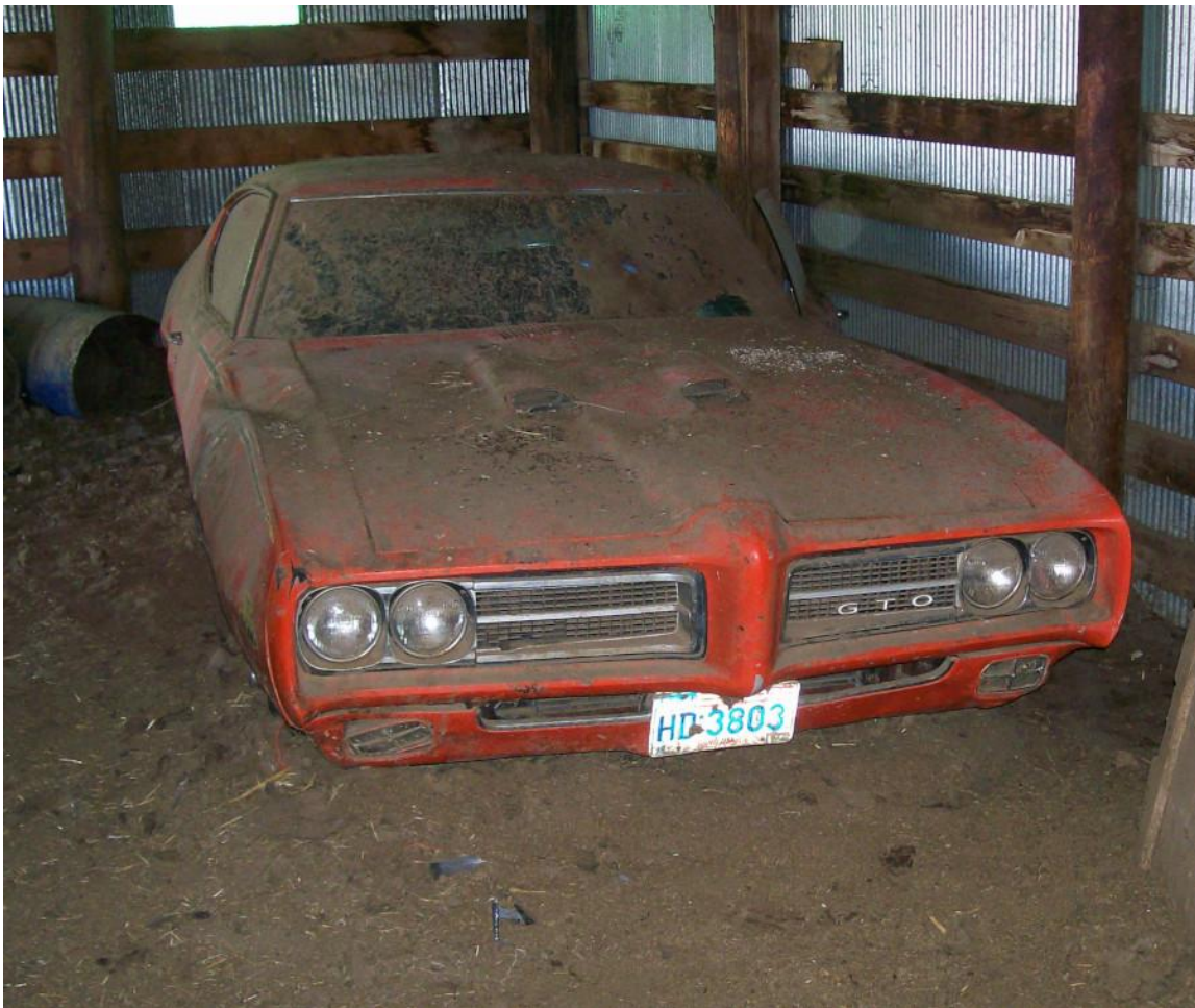
1969 Pontiac GTO

It is hard to explain automotive collectors' fascination with barn or garage "find" automobiles. Sometimes, the vehicles are exceedingly rare and hard to find. For years in this country, many homeowners have passed away, or the family decides to place their loved ones in a nursing home. Today, there are numerous TV series that highlight exciting treasures people have left in their homes, barns or garages.