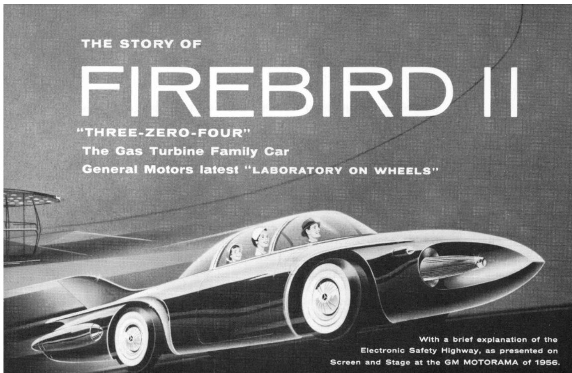
1956 Firebird II show car brochure

During the 1950s, General Motors' Firebird II show car became a special vehicle in American history. In the years since, many people, including myself, have enjoyed its great styling.