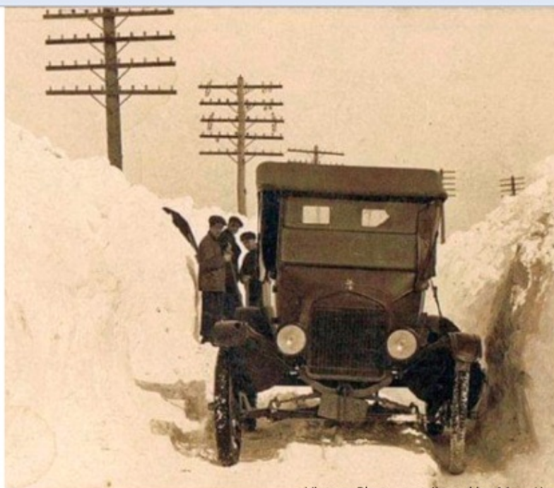
Vintage Photo contributed by Mary Hood