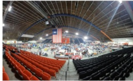
Chrome in the Dome March 15-16