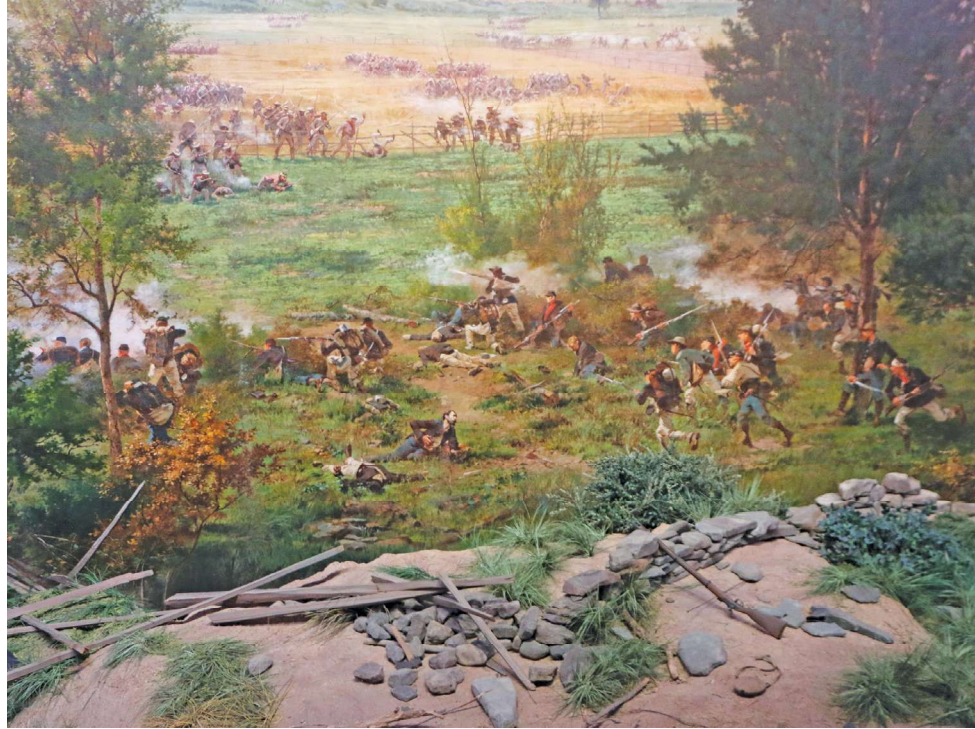
Above: A section of the 1883 Cyclorama painting depicting Pickett's Charge.