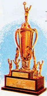
Studebaker wins 1955 Travel and Auto Sports Show Gold Cup at Madison Square Garden —one of 36 International Awards for excellence of design.

GO PLACES with pride this summer in this excitingly speedlined car that's going places fast . . . the automobile world's outstanding honor winner . . . the far-advanced 1955 Studebaker!