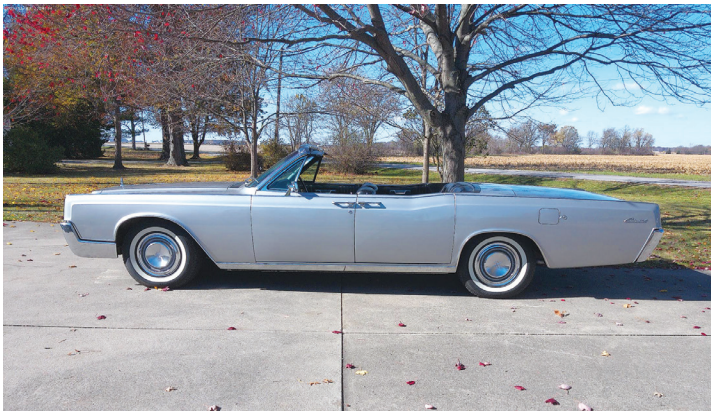
Best Muscle Car Dave Plassman 1967 Lincoln Continental