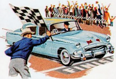
Studebaker wins 1955 Grand Sweepstakes in Mobilgas Economy Run—the second straight year of triumph for Studebaker —America's No. 1 Economy Car.

Go to your nearby Studebaker dealer's now . . . go out for an unforgettable trial drive . . . and then see how little a Studebaker costs. You can get an award-winning Studebaker V-8 or 6 at prices right down with the lowest.