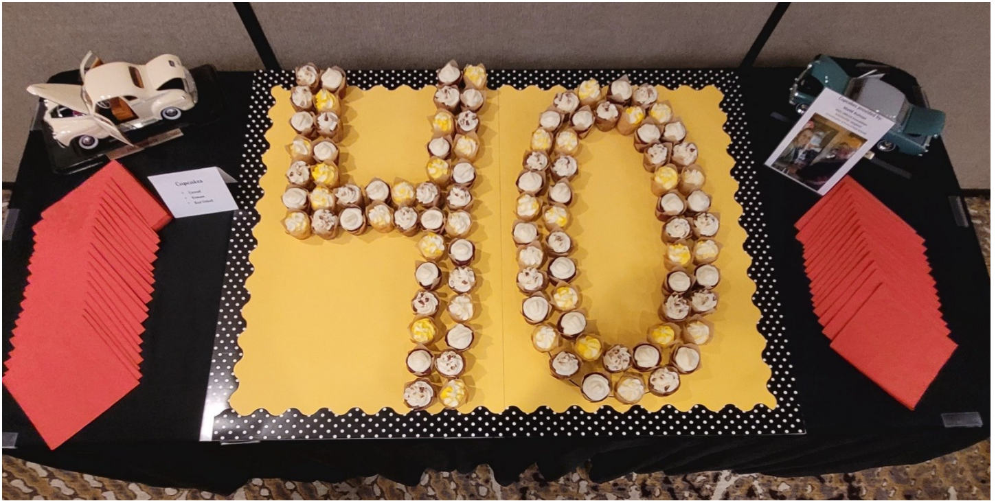
Mini-Cupcakes: Carrot Cake, Lemon Curd, Red Velvet with White Chocolate. Yum!