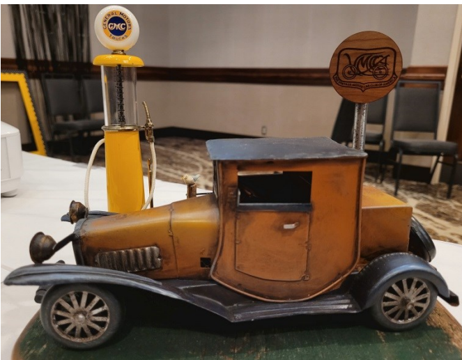
Gift presented to Gold Dust from the Northern Colorado Chapter VMCCA