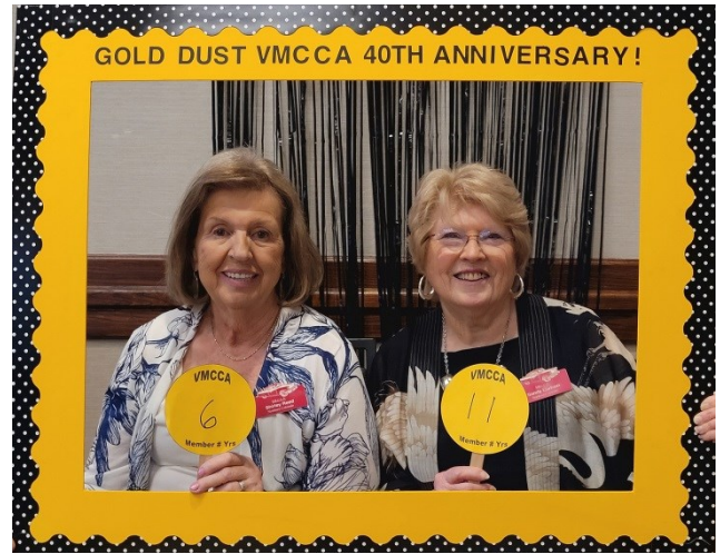
Guests from Mountains & Plains Region VMCCA